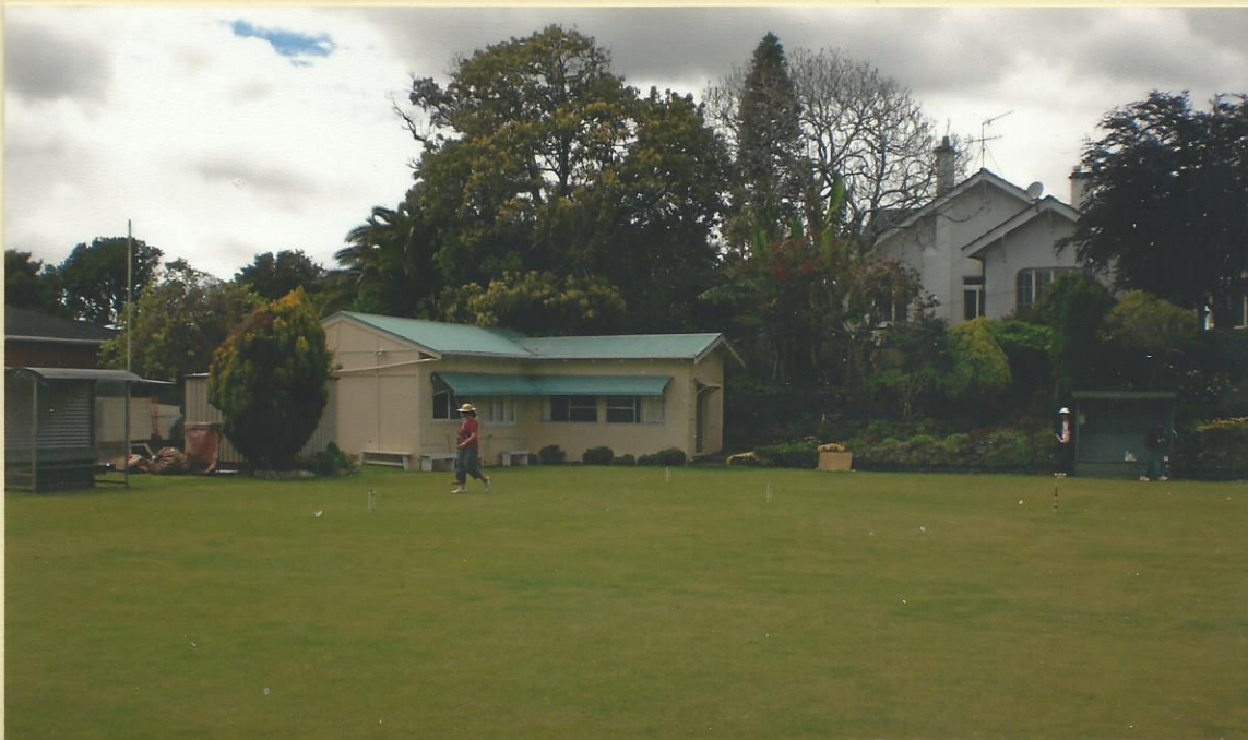
Mt Albert C.C. 1925 - on Lloyd Ave