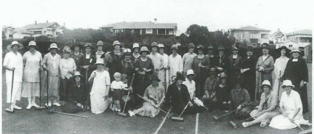
Presidents Day, 1926.