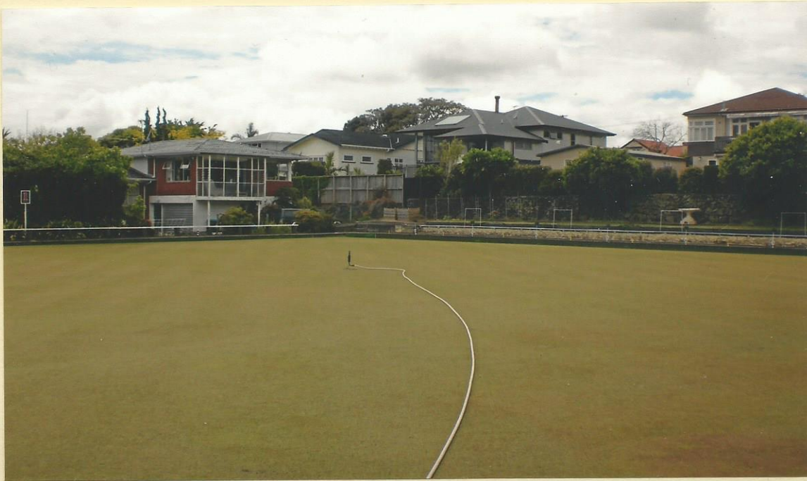
Mt Albert B.C "Upper lawn" Site of Mt Albert C.C. 1913-1924 (2010)