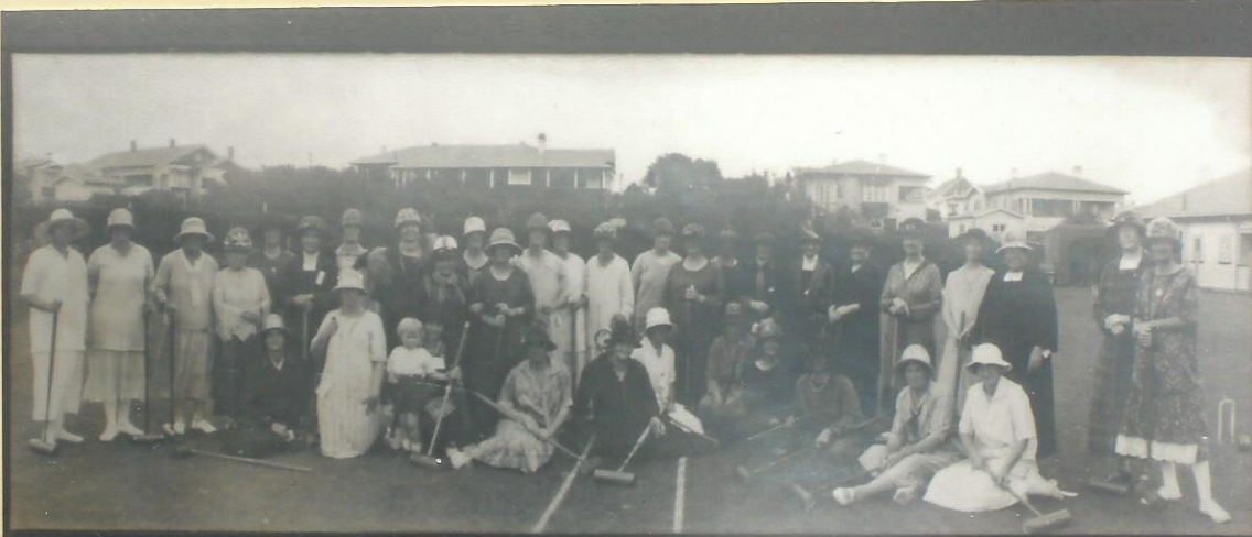
PRESIDENT'S DAY 1926