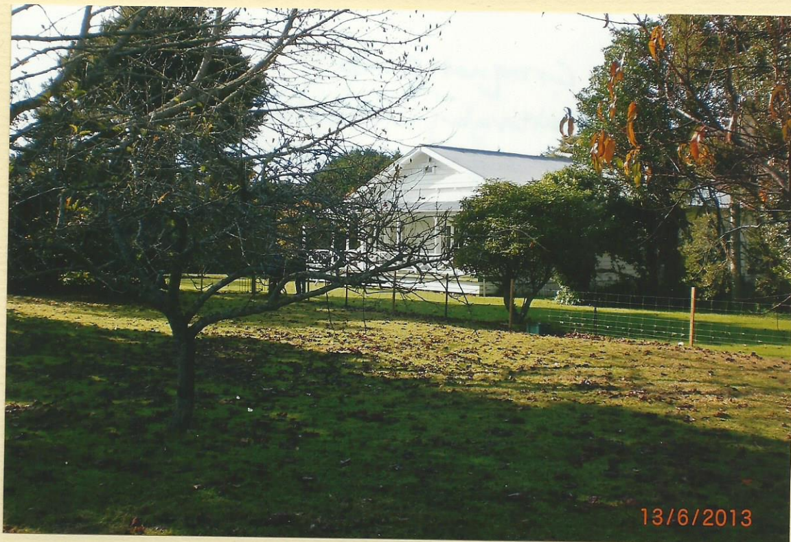
Site of Mauku Croquet Club c 1920 - 43 Compare with 1926 photograph to left.