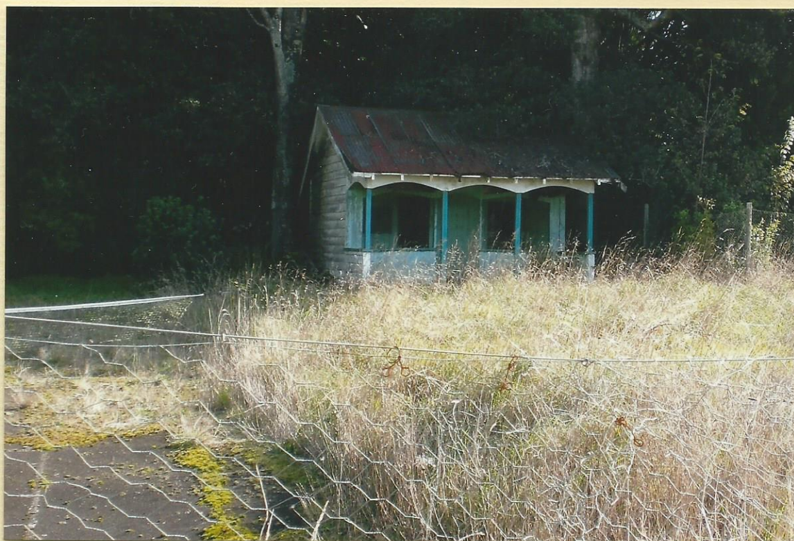
Pavilion shared with Mauku Tennis Club