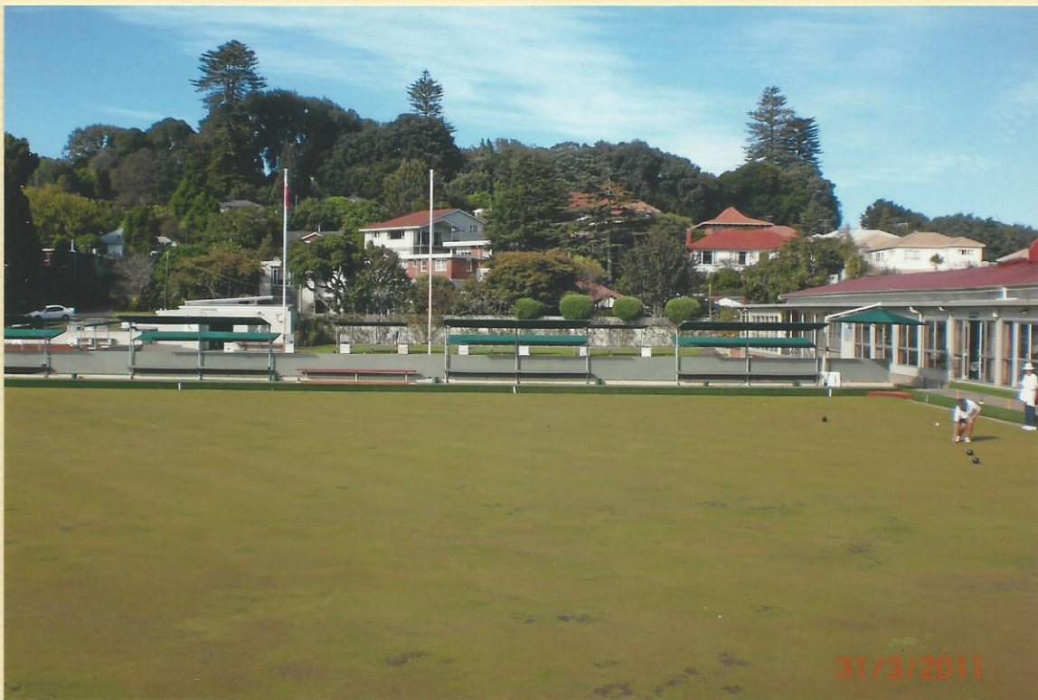
2011 Looking South

Hillsborough The original croquet clubrooms 18 Hillsborough Rd. 100m off the main road (auction date 26 May 2010)