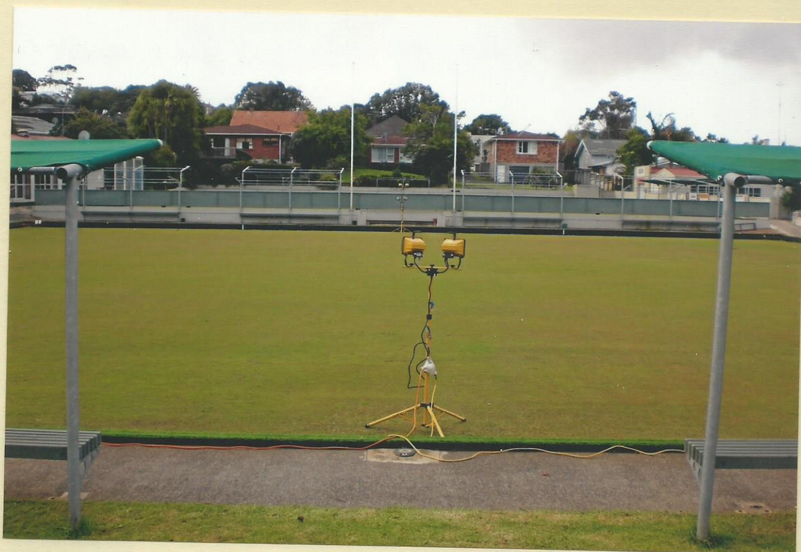
2011 Looking North