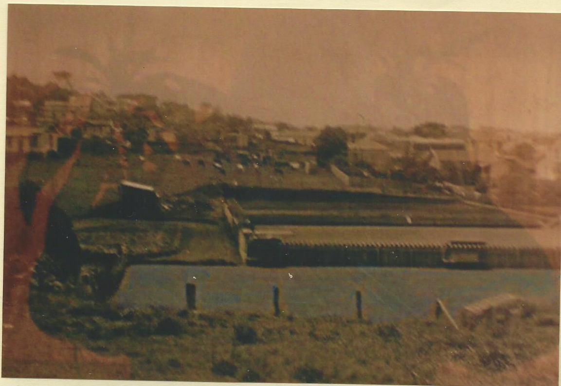
Hillsboro Croquet & Bowling Clubs 1937 - Looking North