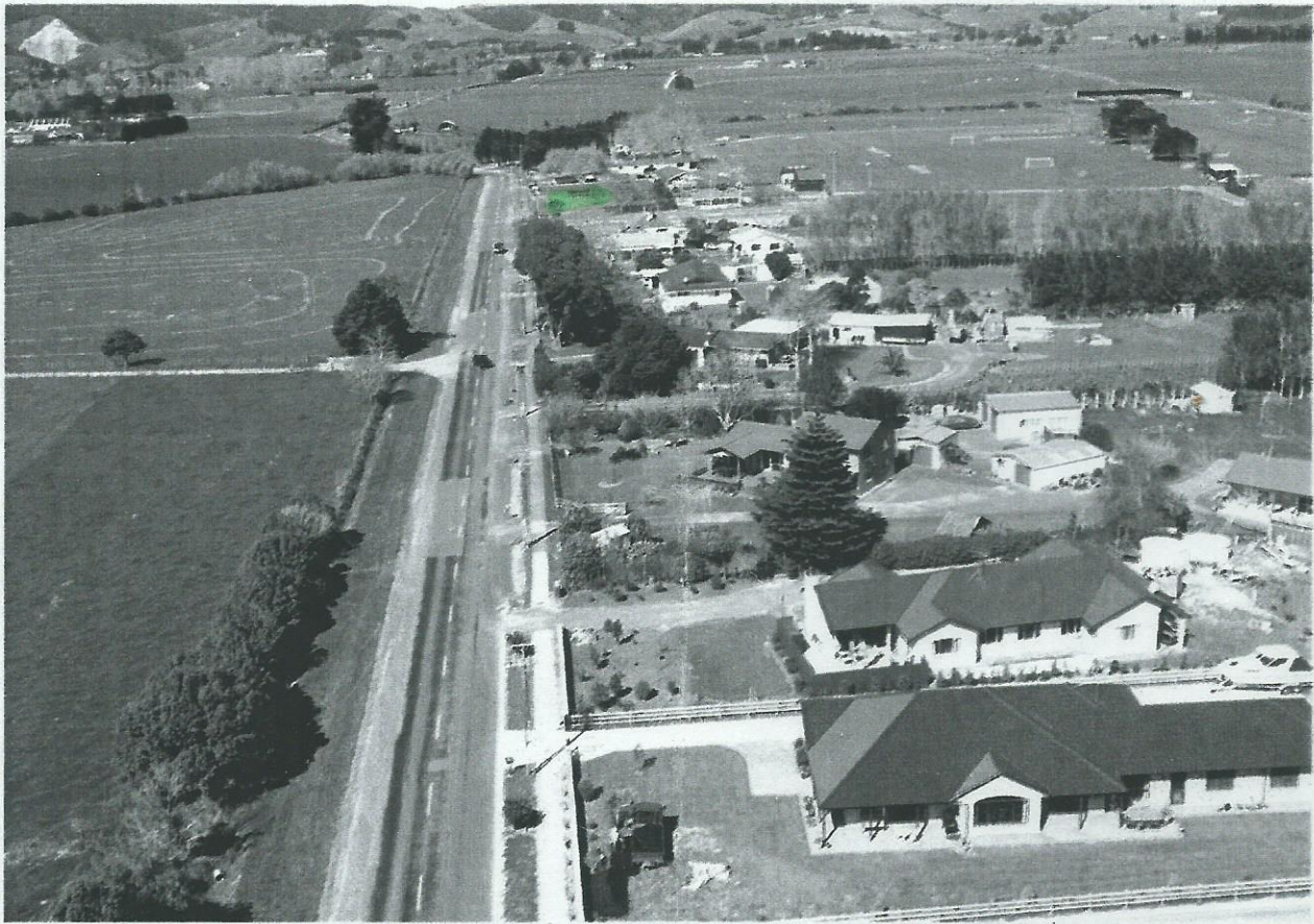
Monument Road — Showgrounds Reserve on far right