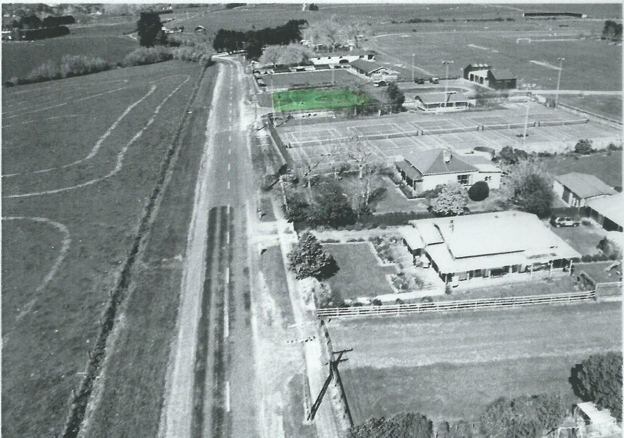
Monument Road showing tennis courts and bowling green