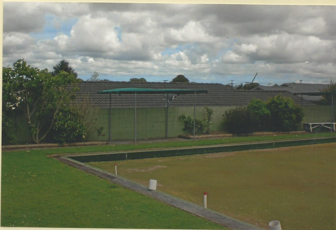
Former site of Avondale Croquet Club over the southern boundary fence of the B.C. Western