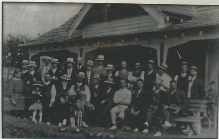
Opening Day - November 8th, 1913